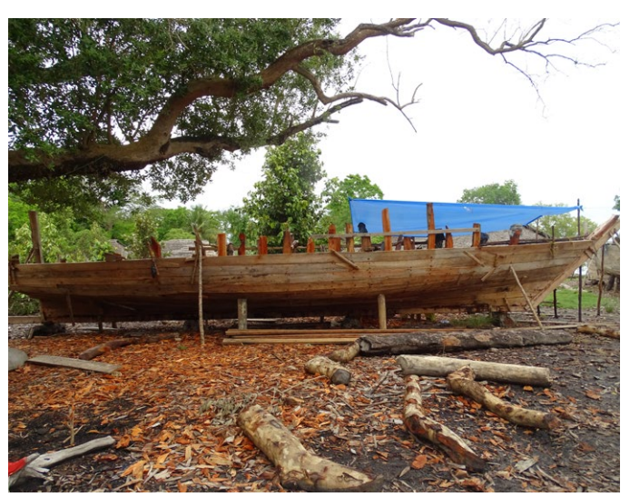
Traditional boat building using mangrove wood in Rufiji Delta, Tanzania

Traditional uses: Provision of wood and non-wood products such as fuel wood, poles, timber, honey and traditional medicines as commodities for both domestic and trade.