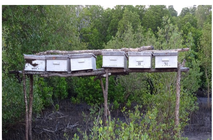
Mangrove-based beekeeping initiatives in Mtwara, Tanzania.

Valuation of mangrove ecosystem services is masked by regulatory complications, such that most of the extractable mangrove products are considered illegal commodities and therefore information on their market chain is not readily available. This largely explains why there is very limited information in literature about the value of mangrove ecosystems in Tanzania. There are also complexities in perceptions and definitions of the economic domain of mangroves associated to social wellbeing and local economies, which often limit the choice of ecosystems services for inclusion into economic valuation. A summary of Mangrove Ecosystem services is presented below.